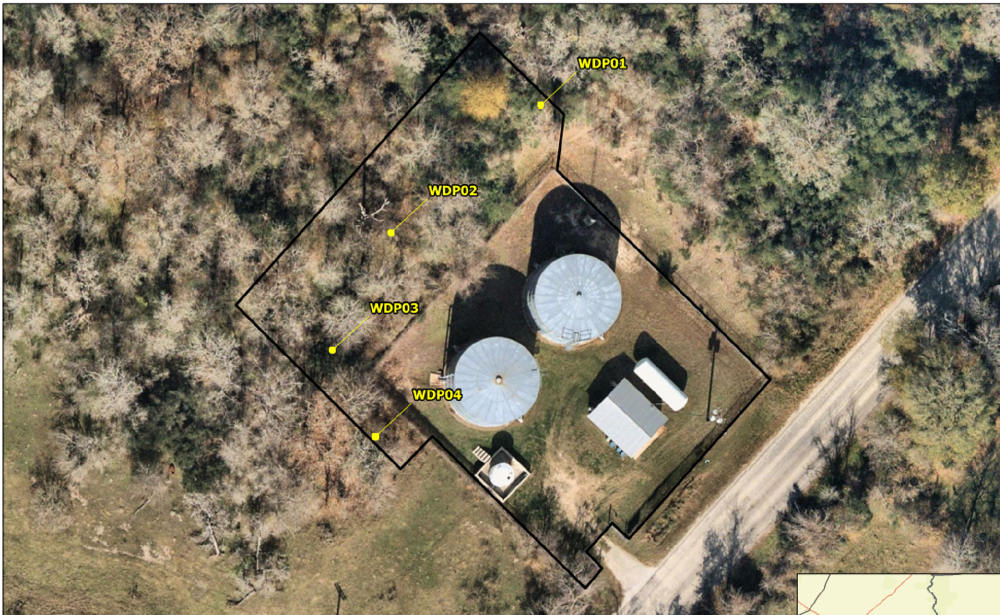
Figure 6: Field Verified Waters

Wellborn SUD Bird Pond Plant Brazos County, Texas